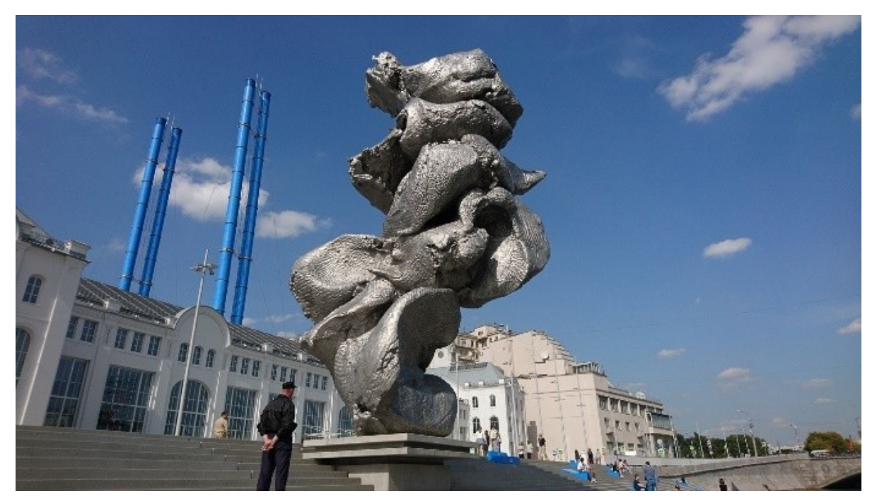
Figure 1. Sculpture "Big Clay #4" by Urs Fischer on the Bolotny' Quay in Moscow. Common view with a guard. The 25th August, 2021.

The depletion and "flattening" of images in contemporary artistic practices can be viewed as a reaction of art to the hyperfunctionality of objects. The things that occupy the space of life absorb the aesthetics of kitsch along with comfort, qualities and functions. The sphere of taste goes to the mercy of designers and trendsetters, influencers and mass media control. Art, on the other hand, turns to the formless in its search for dysfunctional objects with the demand to return to the Kantian "to be beautiful without a reason" (Podroga, 2016, pp. 230). And this formless, which cannot be mastered, it is impossible to cope with it, it differs from the same practices of the Dadaists and avant–gardeists in the irreconcilability of refusal. The formless is not found by chance, it is done, they strive for it as a kind of aesthetics of the disgusting, as a gesture of resistance to gloss, fashion, geometrism and functionality (see, for example, "Big Clay No. 4", Fig. 1).