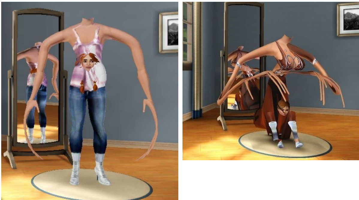
Figure 3. The avatar glitch in The Sims 3.

In the visual area it is worth paying attention to the famous glitch in The Sims 3 (2009), which allows to manipulate with the avatar's appearance settings in a special way to create a comic or a monstrous character (Fig. 3). Thus, the glitch is not reduced to the breaking the process of playing or to the fixed unusual way of representation, the glitch gained constitutive power, which open a door for the new practices, which we not in majority planned by developers, and therefore, they were not inscribed into the initial normalisation structure of game. The result is that digital visibility is leaving the zone of the unprofanable, expected and predictable, and entering on the territory of possible actions. In the area of the workable, not the signified. In the area of profanation.