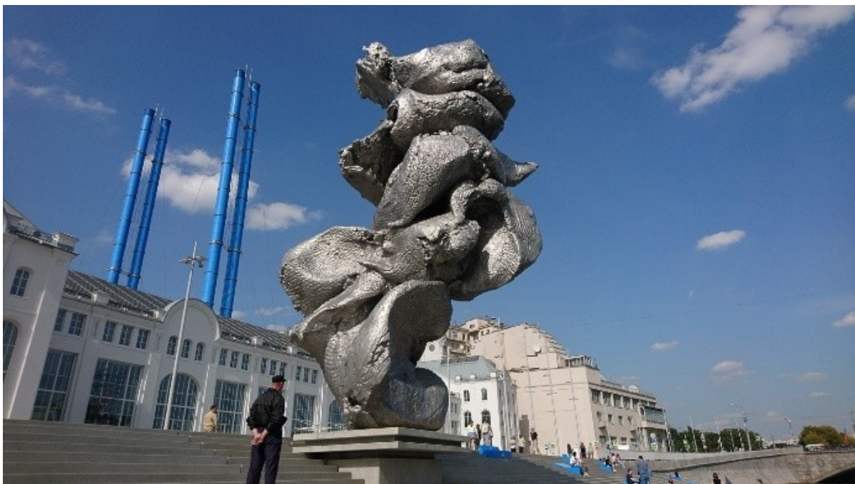
Figure 1. Sculpture “Big Clay #4” by Urs Fischer on the Bolotny’ Quay in Moscow. Common view with a guard. The 25th August, 2021.

The depletion and “flattening” of images in contemporary artistic practices can be viewed as a reaction of art to the hyperfunctionality of objects. The things that occupy the space of life absorb the aesthetics of kitsch along with comfort, qualities and functions. The sphere of taste goes to the mercy of designers and trendsetters, influencers and mass media control. Art, on the other hand, turns to the formless in its search for dysfunctional objects with the demand to return to the Kantian “to be beautiful without a reason” (Podroga, 2016, pp. 230). And this formless, which cannot be mastered, it is impossible to cope with it, it differs from the same practices of the Dadaists and avant-gardeists in the irreconcilability of refusal. The formless is not found by chance, it is done, they strive for it as a kind of aesthetics of the disgusting, as a gesture of resistance to gloss, fashion, geometrism and functionality (see, for example, “Big Clay No. 4”, Fig. 1).