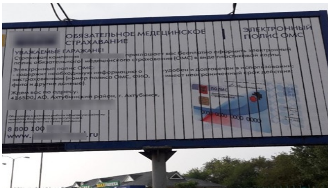
Figure 1. Examples of illiterate advertising

There were also curious cases of installing outdoor advertising. For example, two ads installed in close proximity to each other lose their purpose, but entertain the residents of the city, making them laugh. (Fig. 2).